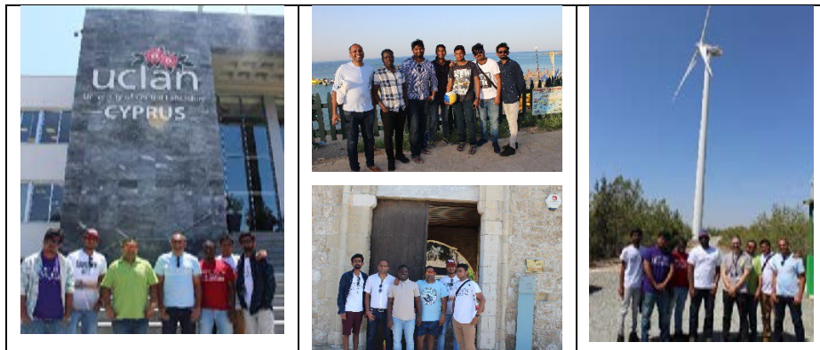
Engineering Summer CPD Activities and MSc Engineering Students Industrial Visits and International Travel