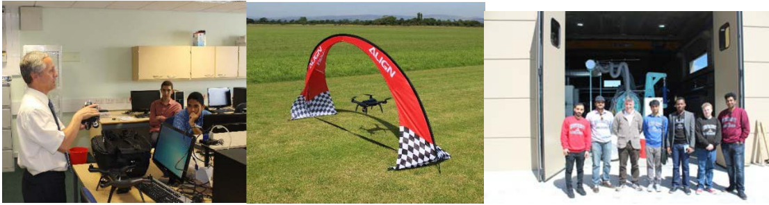
Engineering Summer CPD Activities and MSc Engineering Students Industrial Visits and International Travel