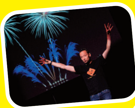
Science of Fireworks 2017

"Good to see companies such as BAE there, it shows children how science is relevant outside school." 2017 visitor