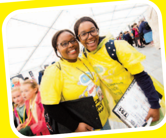
Festival ambassadors 2017

"Great atmosphere for exhibitors and visitors." 2017 exhibitor