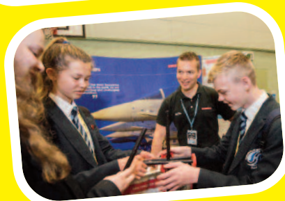
Science Showfloor 2017

"Extremely well organised, and lots of different shows - something for everyone!" 2017 school group