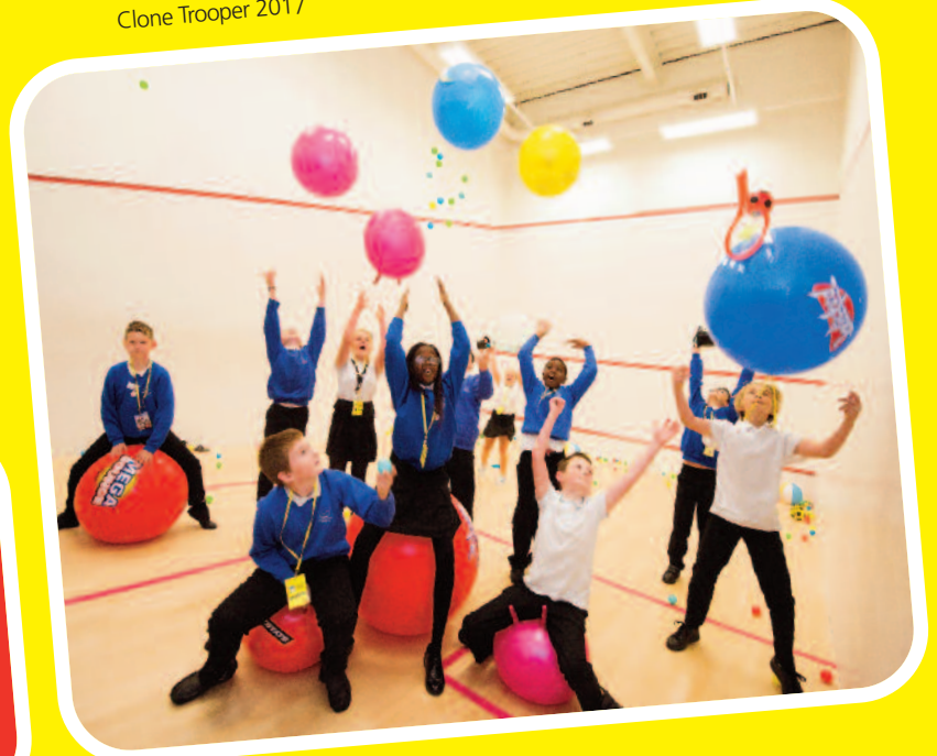
Fun Zone 2017

"Fantastic day out. My son said it was the best day out he'd ever had." 2017 visitor