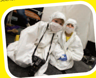
Science Showfloor 2017