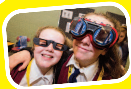
Science Showfloor 2017