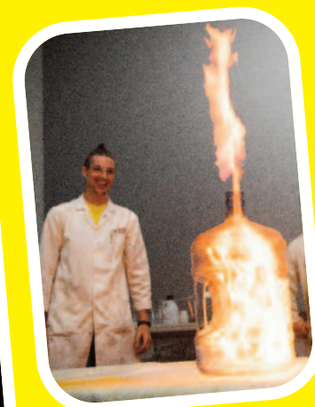
This is Chemistry 2017

"One of the highlights of my year. This is a fantastic event and I am going to persuade more of my colleagues to get involved." 2017 exhibitor