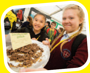
Science Showfloor 2017

"Family friendly free interactive science – just brilliant!" 2017 visitor