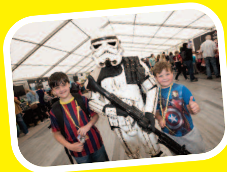
Clone Trooper 2017